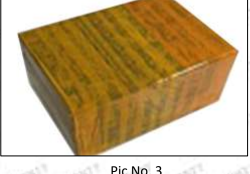
Pic No. 3 International express packaging: Wrapped with yellow tape after wrapping black protective film